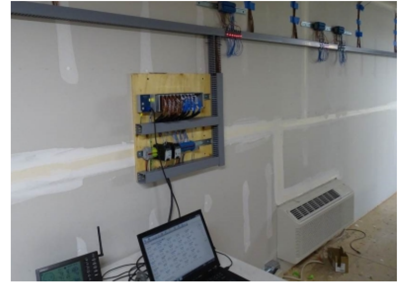
Interior of Ventilation Test Structure showing array of sensors feeding various key measurements into laptop for data logging.

The CSSB Ventilation Test structure is standing tall in York, PA! Housed on the Intertek Testing Services NA Ltd. grounds, this extensive multi-year test will provide detailed information about the moisture and temperature effects of various cedar roofing systems, using a variety of underlayments/non-permeable membranes and continuous ventilation products. We are nearly finished sensor calibration and after that the real data logging will begin. Many marketplace participants, including architects, builders and roofing contractors, have already expressed keen interest in obtaining the results. We're glad to hear so many people consider the CSSB's investment in science to be money well spent!